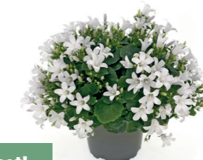
TESS (CMPT 1708)